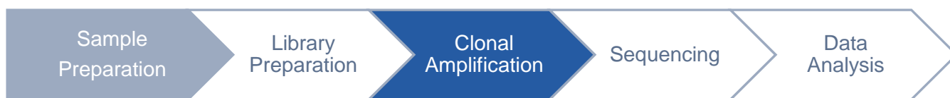
A generalized workflow for NGS

DNA sequencing has witnessed phenomenal growth in the past two decades. “Next Generation Sequencing” (NGS), which utilizes massively parallel sequencing, is driving a million-fold reduction in cost and even greater levels of time saving. Today, a human genome can be sequenced (as one of 48 being sequenced simultaneously) in 44 hours. This is effectively more than one genome per hour at around $1,000 each. Future sequencing applications will require even higher throughput, lower costs and greater accuracy to meet clinical demands. These improvements will enable new product offerings – with applications at point of care facilities and in non-laboratory field settings.